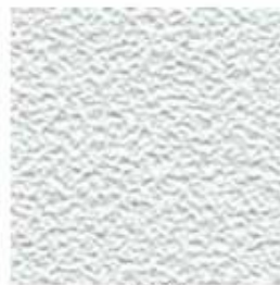
AC100 Pebble Grain Vinyl