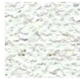
AC200 Nubby White Cloth