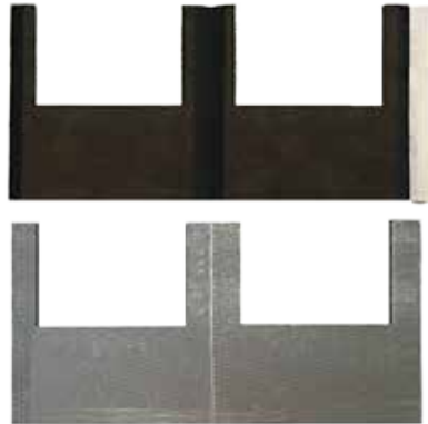
(2) Air Chute components to form complete chute.