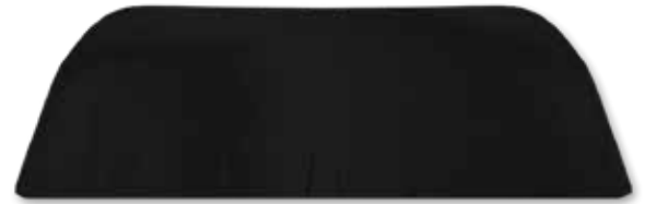
Hood Section to place over top of assembled Air Chute.