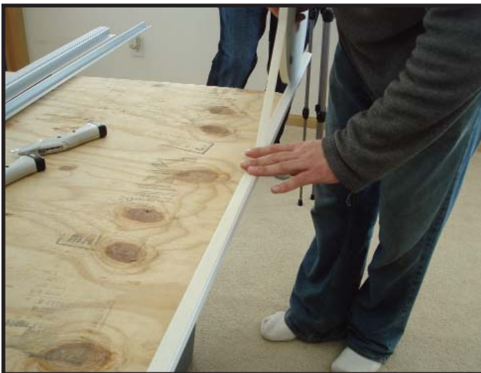
Preparing Angle (if applicable)