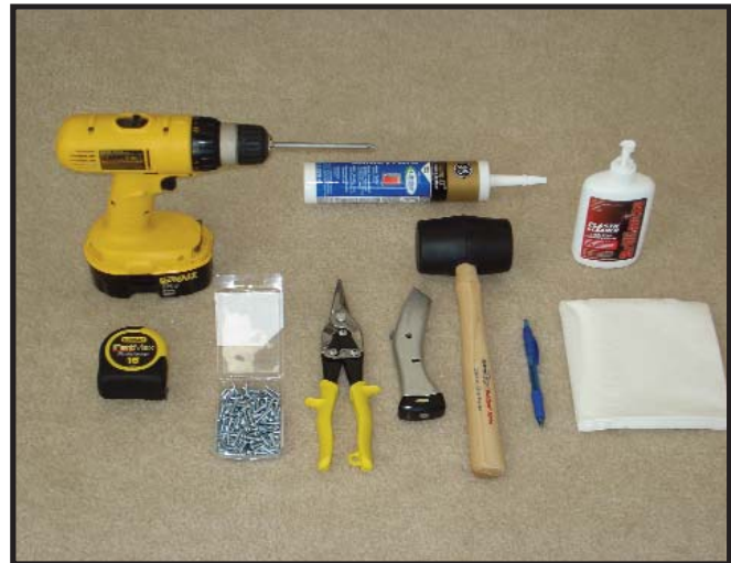
Items Needed for Installation

PLEASE NOTE: Attachment angles may need to be cut to size during installation. Additionally, once the window insert has been dry fit, removing the protective film may require removal of the frame that houses the Plexiglas.