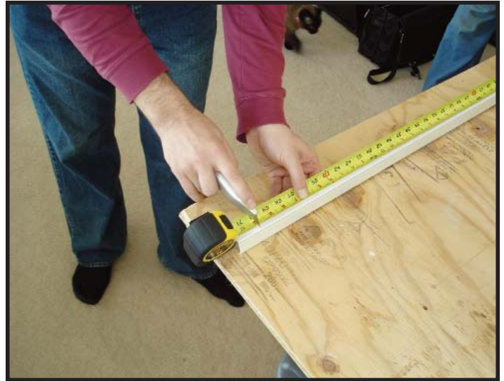
Measuring and Cutting