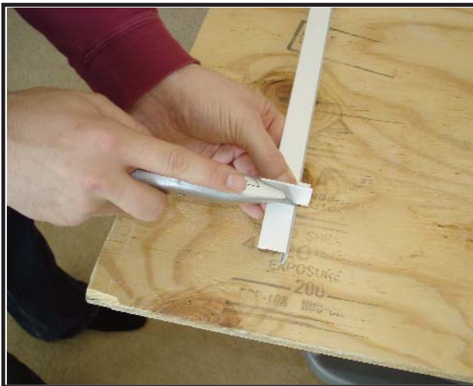
Measuring and Cutting