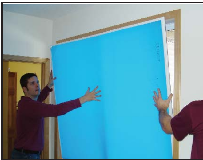
“Dry Fit” of PrivacyShield ® Window Seal