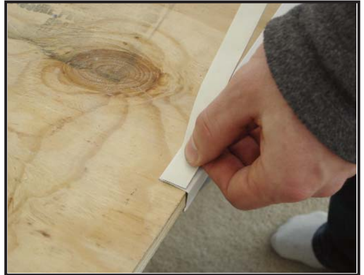
Preparing Angle (if applicable)