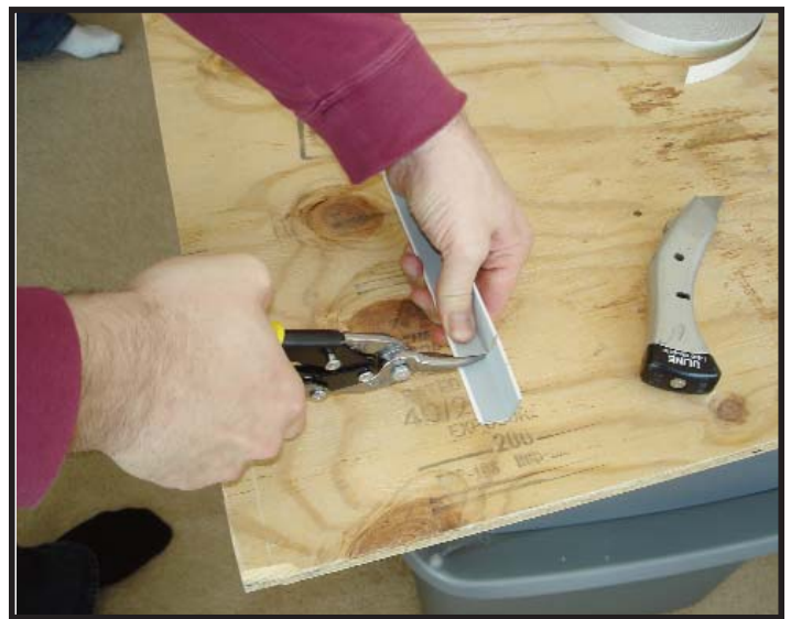
Measuring and Cutting