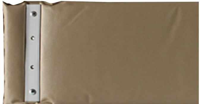
Weather Resistant Panel with Aluminum Stiffener/Gripper Bar