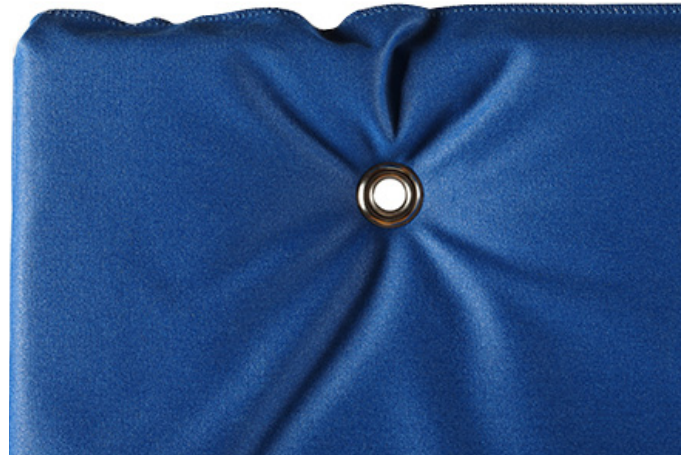
Weather Resistant Baffle with Grommets in Panel